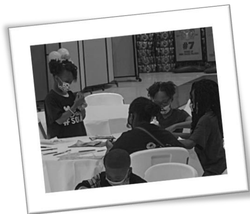
Children Division Craft Project 2022